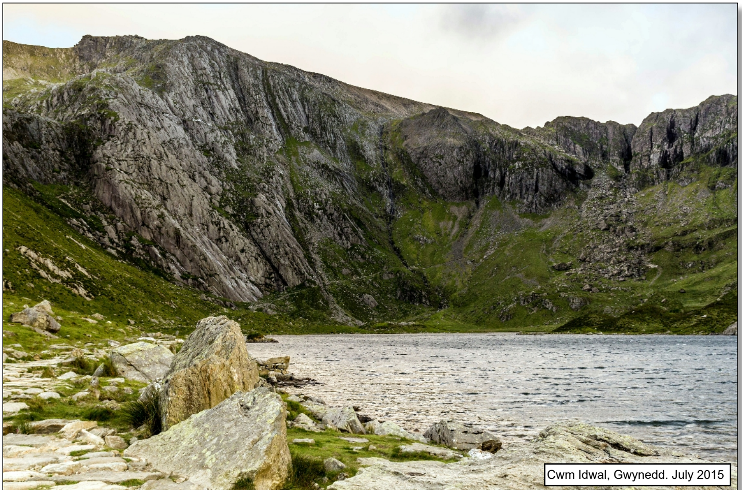
Cwm Idwal, Gwynedd. July 2015

"At this time we are particularly concerned about the expansion of fracking for shale gas. The UK needs to be investing in efficient and renewable energy, and reducing demand, not in additional fossil fuels. Fracked gas is not the low-carbon solution some suggest that it is and is incompatible with tackling the climate crisis. It is destructive of the environment, land and communities.