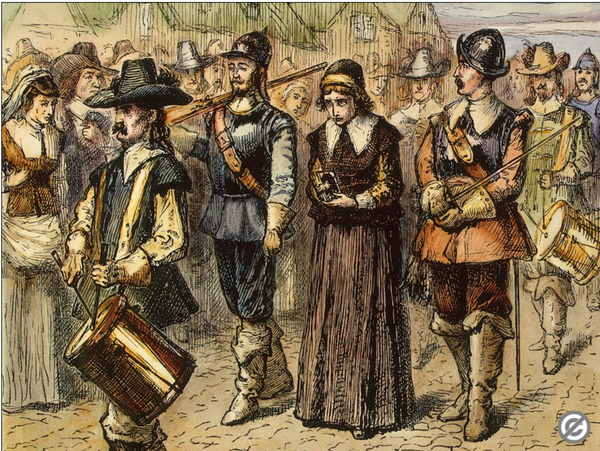
Quaker Mary Dyer led to execution on Boston Common, June 1, 1660.

"Humanity needs leaders of integrity and conscience, ready to be held to account by individuals and institutions, national and international. We pray for those in positions of power. We call on them, as public servants, to work with all of good faith to build the world we seek, to fertilise the soil in which the tender shoots of peace, love and unity may flourish."